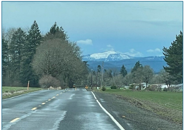
on North Road heading west in Forest Grove

We also heard many kudos at the restaurant at the end.