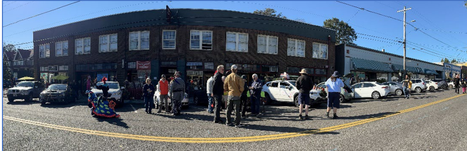
Rally cars lining up on Spirit of Halloweentown's Main Street in St. Helens

Twenty-six teams entered Cascade Sports Car Club's 57th Ghouls Gambol Rally on Oct. 28. It was a beautiful sunny day. Many rally teams arrived at the start in decorated