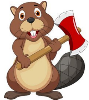
2023 Oregon Trailblazer Rally aka The Beaver Cleaver

The first Oregon Trailblazer Rally was May 13-14, 1961. The last known prior offering was May 13, 2006. It was offered annually and then sporadically over the intervening years. Hopefully this year's revival will encourage future Geargrinders organizers to offer this trick-and-trap style event on a regular basis.