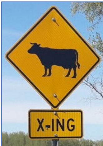
Not a "XING"

And just in case you were not paying attention, the next challenge is another main road protection challenge set up by an ITIS instruction with a pause. This time, however, the ITIS instruction can be used because it does NOT follow the main road, so the correct action is to use the ITIS and its pause. See – you can't always just skip the ITIS and its pause.