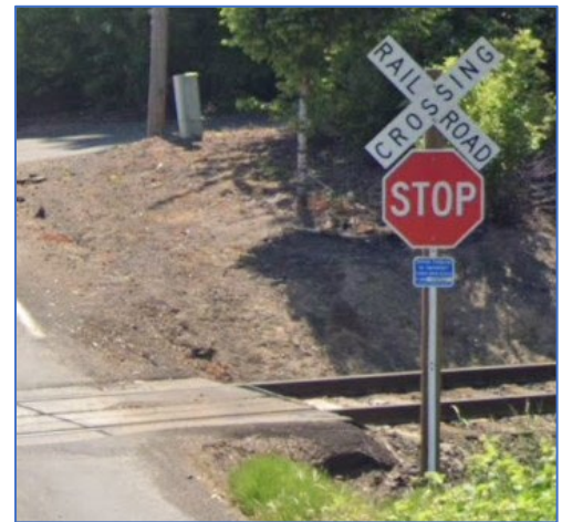
Not a STOP

Next is another main road challenge, presented a bit differently than the previous one. An ITIS instruction with a pause is offered at an intersection where the instruction would take you in the same direction as the main road by protection. The correct action here is to skip the ITIS and its penalty pause.