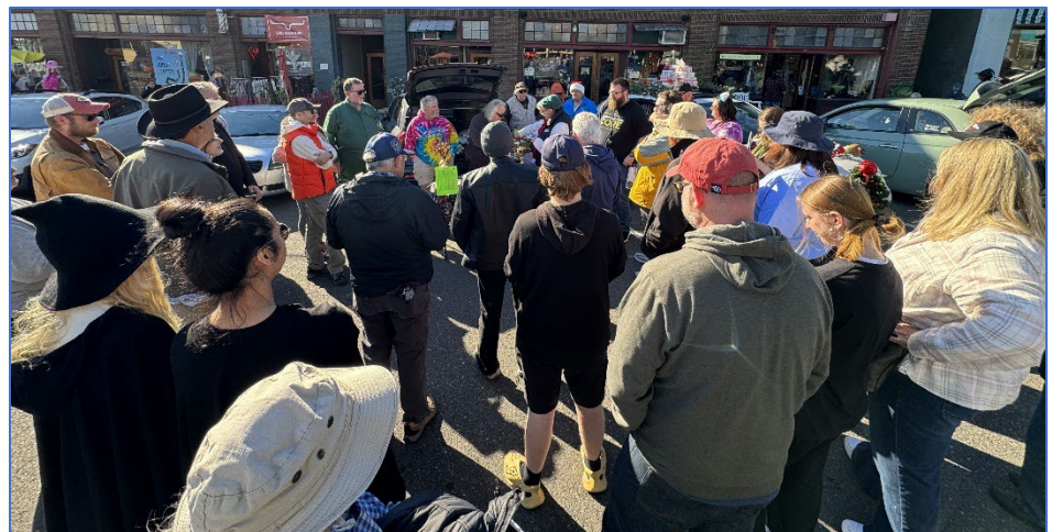
Trophy presentation time