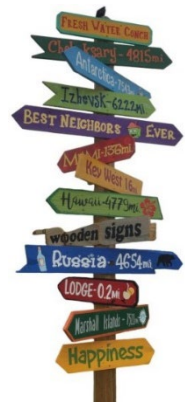
That's the Way March 2026 rally