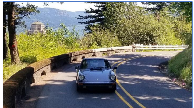
Car #20 leaving Crown Point