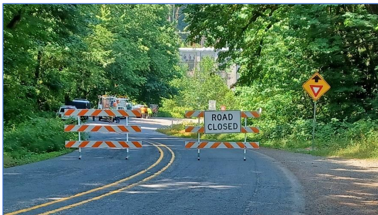
Bull Run Bridge closed on rally course measurement day

There was one more ONTO challenge, one protection, and two left at T challenges. Yes, L at T is still a challenge.