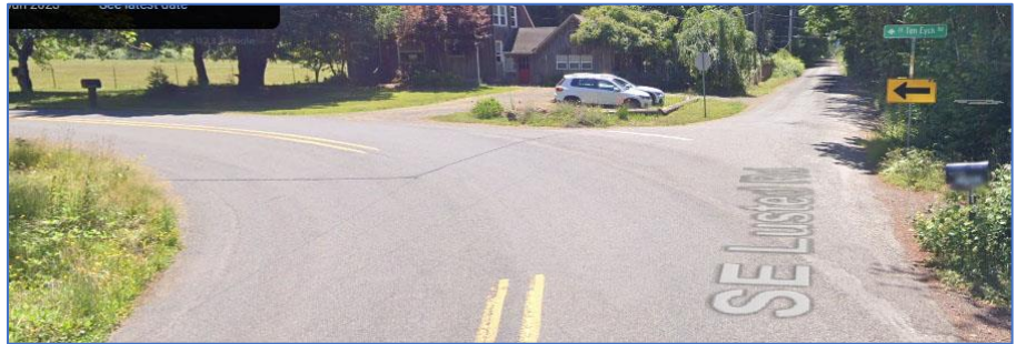
Lusted Road goes straight

We saw only a couple teams follow the on course route straight on Lusted. An OR instruction offered a two-minute pause to the off course teams since the on course route was longer. Leg 7 scores reflect how this challenge worked out.