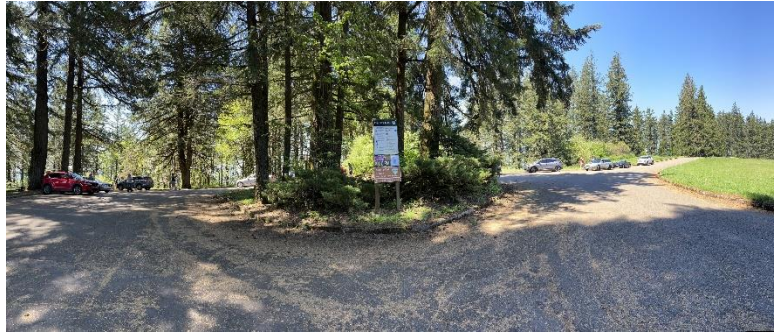
Entrance to Bald Peak Scenic Viewpoint