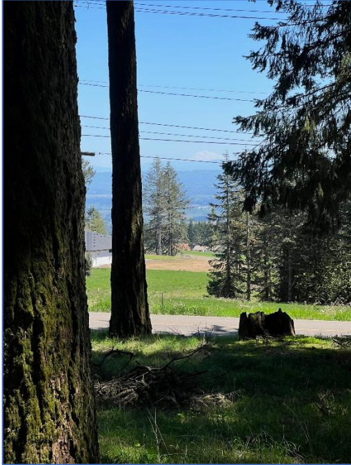
From Bald Peak looking east at Mt. Hood