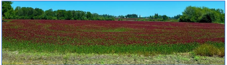
Crimson Clover, just starting to bloom