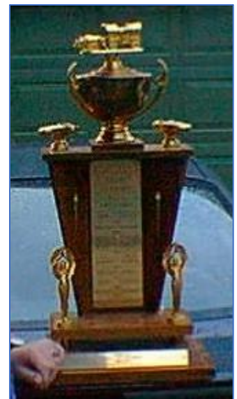
Have you seen the Oregon Trailblazer trophy? If you find it, please contact rally@cascaadesportscarclub.org

Fourteen (14) teams pre-purchased rally entries with a seven-event Series Pass (four teams) or a nine-event Season Ticket (ten teams). These pre-paid entries ensured a steady number of entries at each rally. What we saw in 2022 was a downturn in the number of new first-timer rally teams.