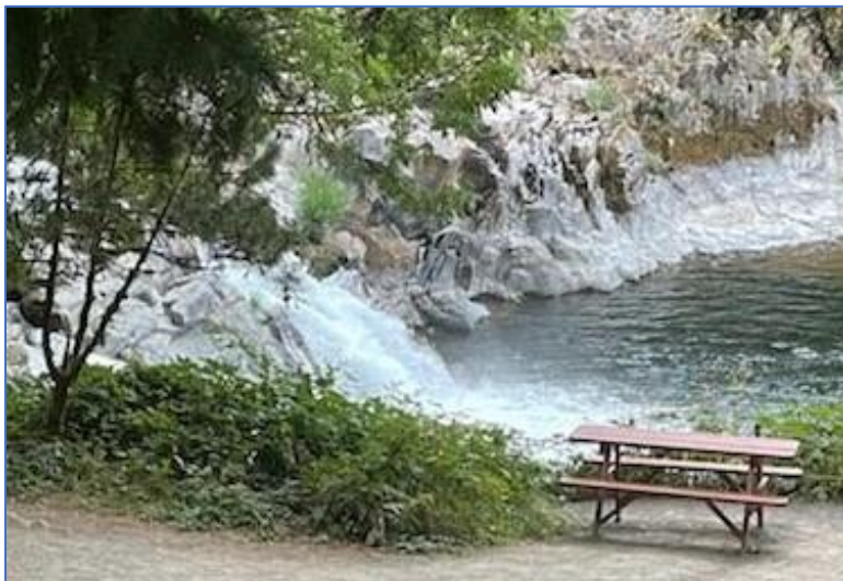
Photo of Lucia Falls

Rally rules say you have finish one instruction before you start the next, so you go the 1.3 miles at the first speed, and then you change your speed and start looking for an opportunity to go right. If you don't go the full distance and take the first right you come to, you take an off course short cut with a long pause at the end.