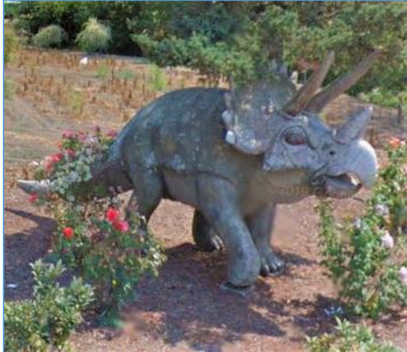
Triceratops on Kansas City Road

We enjoyed writing this rally. We used many of our favorite rally roads, roads we like to drive even when we're not on a rally. Our goal was to present a typical Cascade Geargrinders Saturday Series rally, including most things you'd expect to encounter. It was a teaching rally. And it seems it was successful.