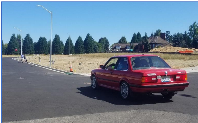
Car 17 Driver Marinus and Navigator Renee Damm, looking for the end odometer calibration at a stop sign, which stop sign?

The phone rang. Just as I was pulling out of the driveway, Car 1 asks "you intended for cars to go down 40th Street?"