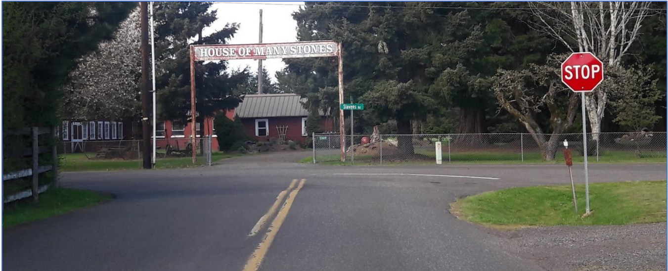
The House of Many Stones

The rally route was about 70 miles from the start in northwest Portland to the ending location in Scappoose. It took under two and half hours to complete the event. The route included a lap around Sauvie Island, a drive up Cornelius Pass to Skyline, down scenic Rocky Point Road (an exciting drive even at 23 mph), a low-land tour of the Scappoose dike, through the backroads of Warren past the House of Many Stones, west into the foothills of