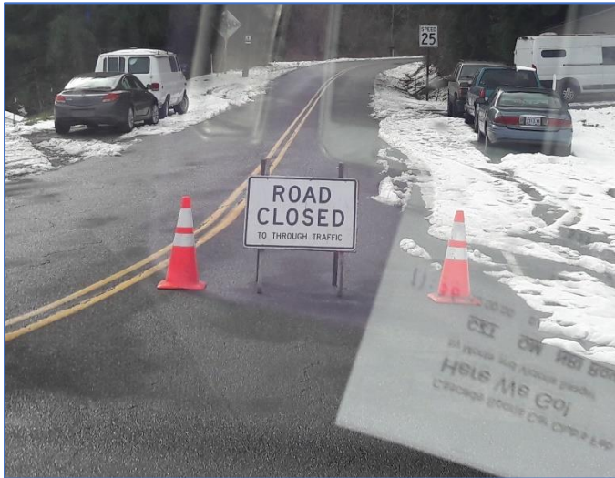
Logie Trail was a vital link in the planned Rally School Rally route. "Was" is the important word here.

The Rally School Rally was originally scheduled for Feb. 20. The checkout was scheduled for Saturday, Feb. 13,