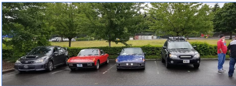
More cars at the start

not been in that area in several years and Basket Flat amongst others brought back some memories. I don't know if I've ever been down that road that direction before. The break was great. The restrooms had running water and soap - great. The duration was perfect for that location and we walked down to see the falls.