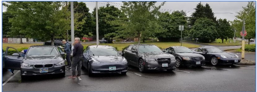
Cars at the start