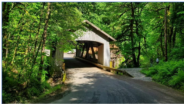
Cedar Creek Covered Bridge

The route included driving over the Cedar Creek Covered Bridge and by the historic Cedar Creek Grist Mill. The all-paved route was just under 100 miles and took a bit over 3 hours to complete.