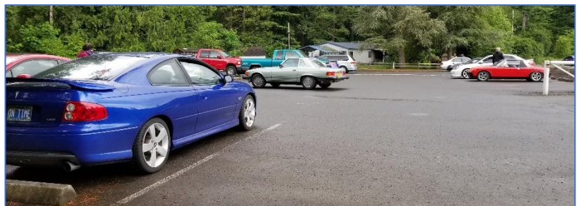
Cars at Lucia Falls Park

Some folks probably didn't read the pre event briefing! Or understand it? That was another fine document to serve as a comprehensive driver's meeting and included some nice tips such as using time decs, rally etiquette to deal with a car in front of or behind you and route/NRI specific mentions. I don't mind folks sitting on our bumper from time to time